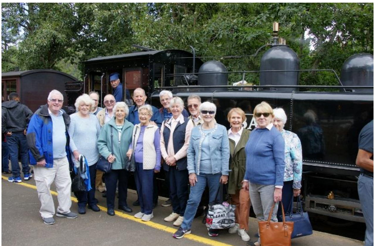
Club members who enjoyed the “Natter Platter” train trip

There is more on our web page – http://probusblackburnsouth.org.au Worth a look It is sponsored by the Bendigo Bank, in Blackburn South. PAV Web site: www.probusvic.com.au