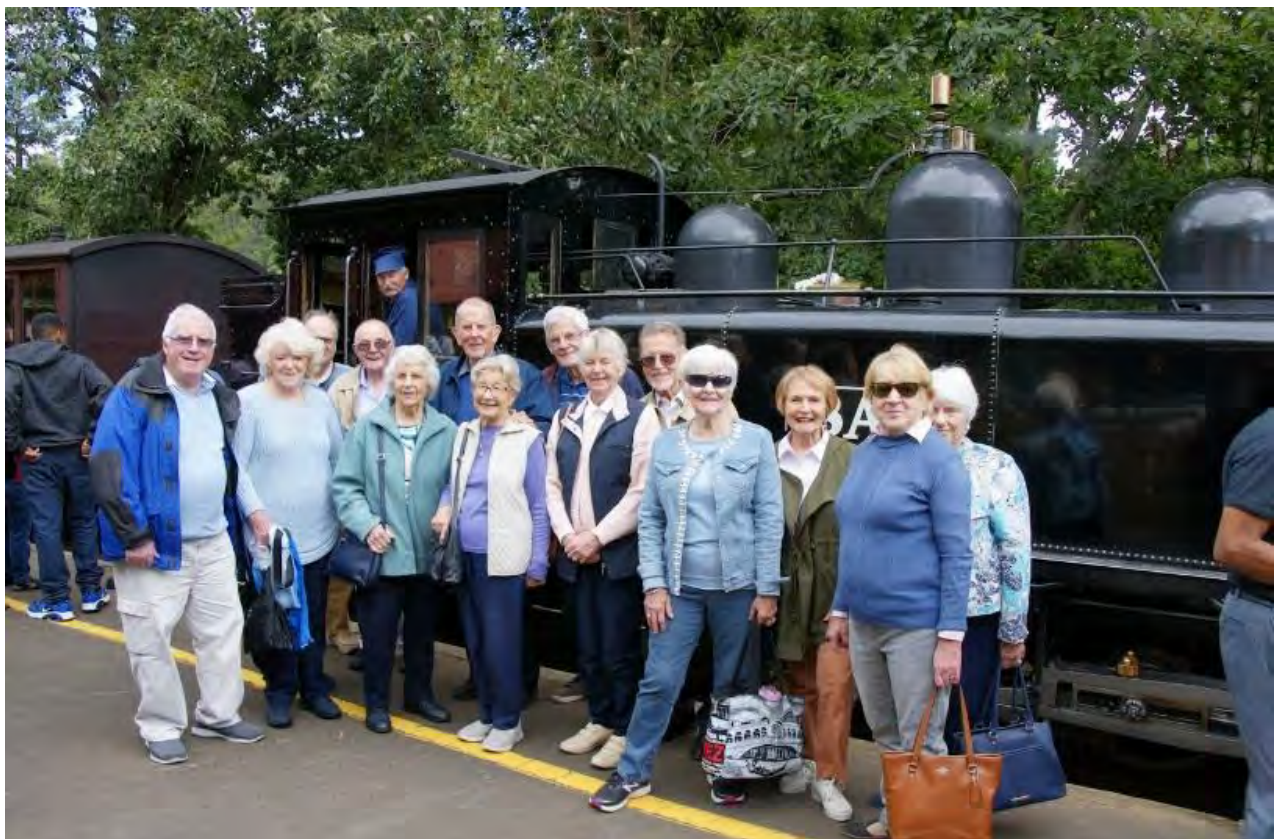
Club members who enjoyed the "Natter Platter" train trip

There is more on our web page – http://probusblackburnsouth.org.au Worth a look