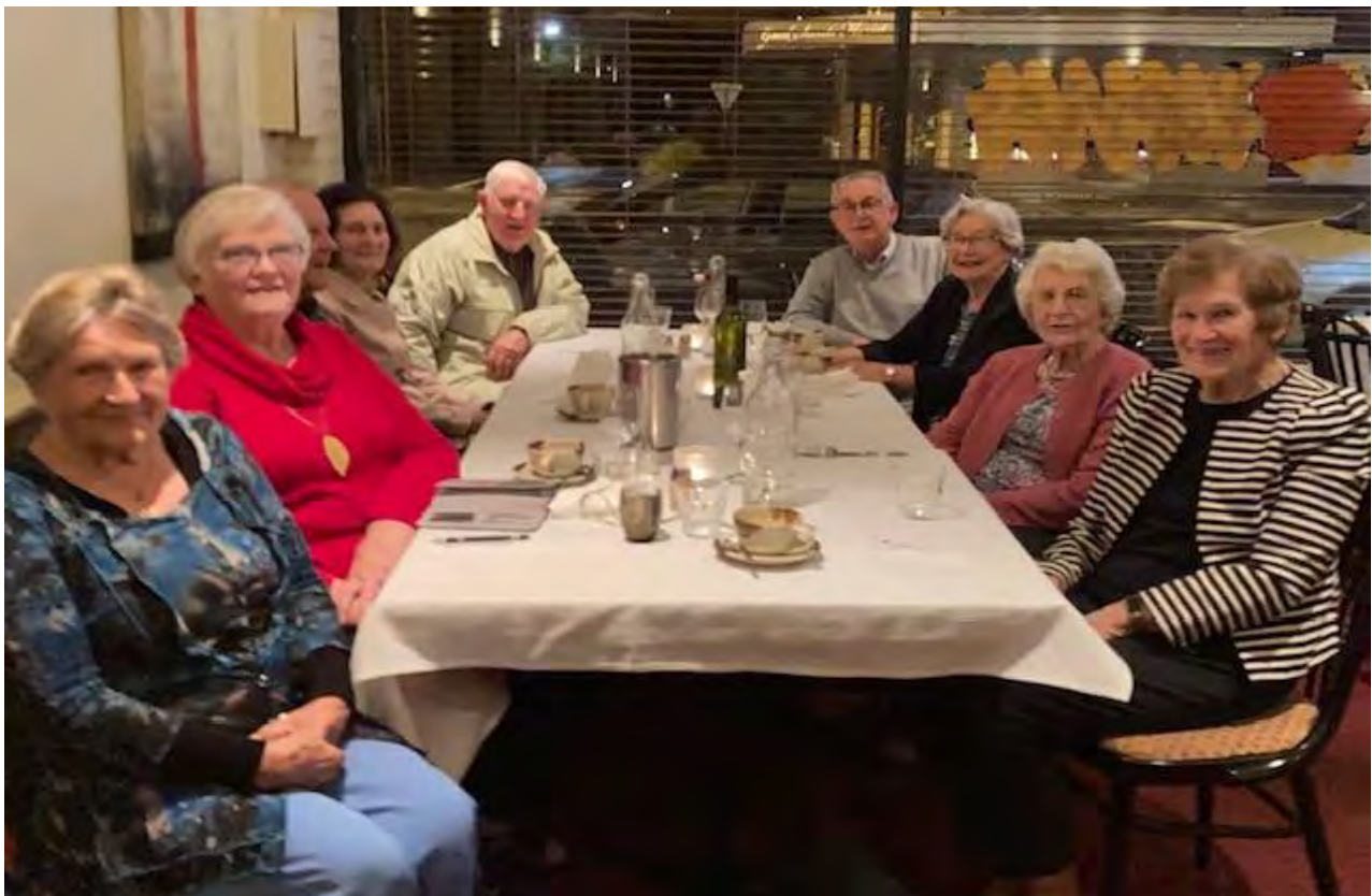
Members enjoying dine-out at Poppies Restaurant.

We (Y.&W.) love to go there not only for a beautiful walking area in a country setting but also for a sizeable slice of a very nice apple, or apple-walnut cinnamon pie with cream and a good coffee for $10.50.