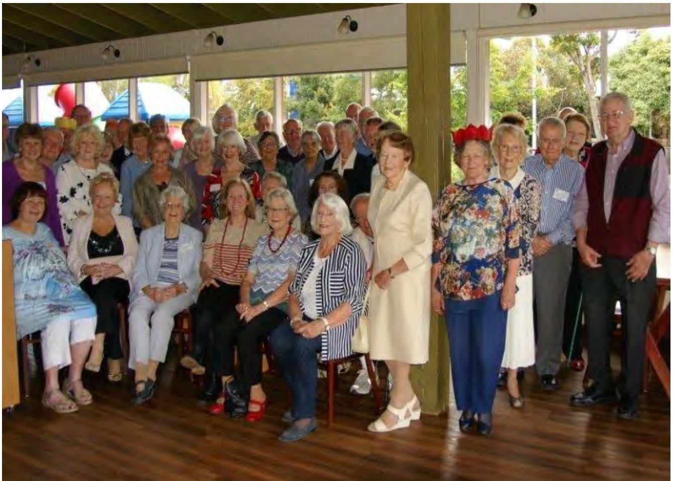
Probus Xmas lunch at Sophia's

PLEASE RING WOLFRAM ON MOBILE 0401 156 920 IF YOU WILL BE ATTENDING.