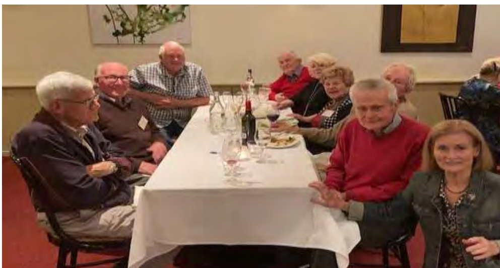
Members at Poppies Restaurant