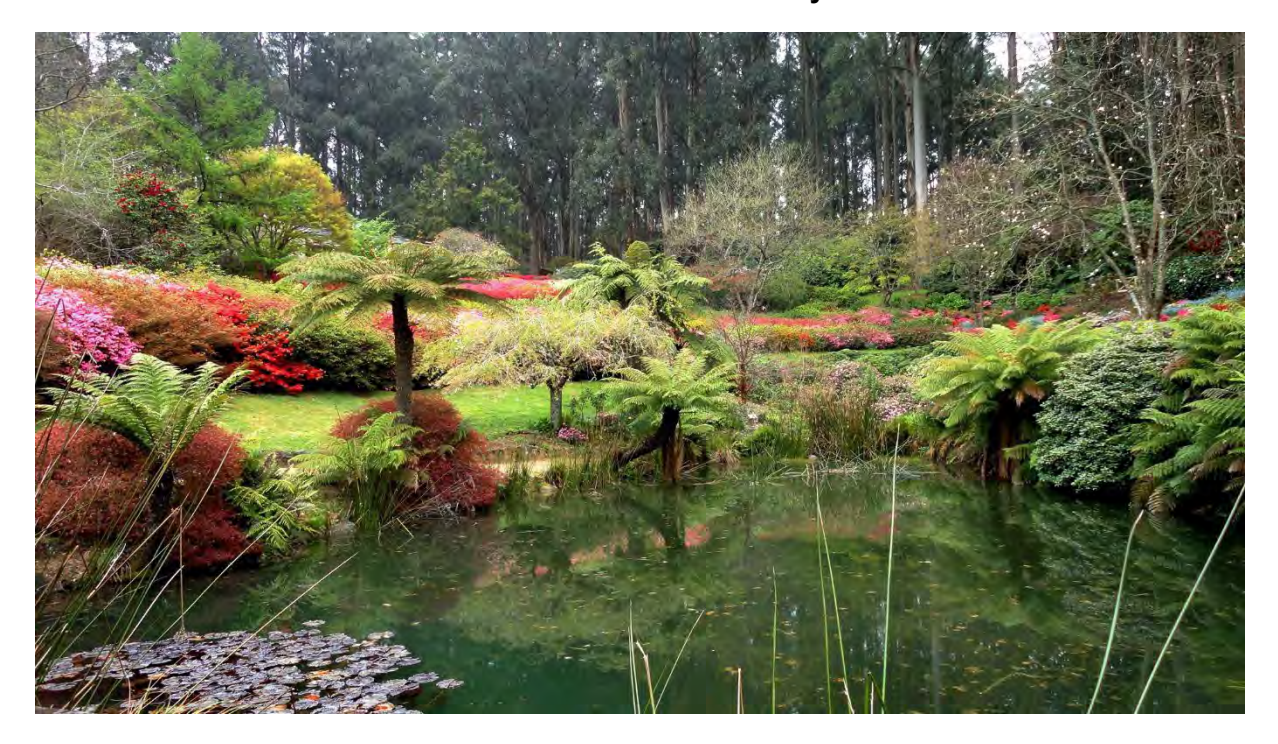
Wednesday 27<sup>th</sup> April. Dandenong Ranges Botanic Gardens, 24 Georgian Rd. Olinda.

Open sided bus for a trip around gardens leaves at 11:00 am.