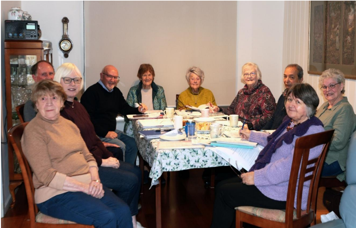
Management Committee Meeting