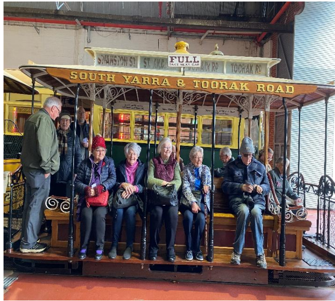
Members at Tram Museum