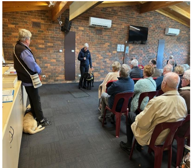
Seeing Eye Dog