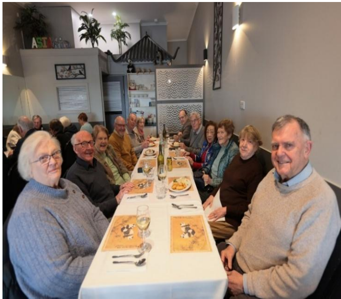
Asian Garden Chinese Restaurant