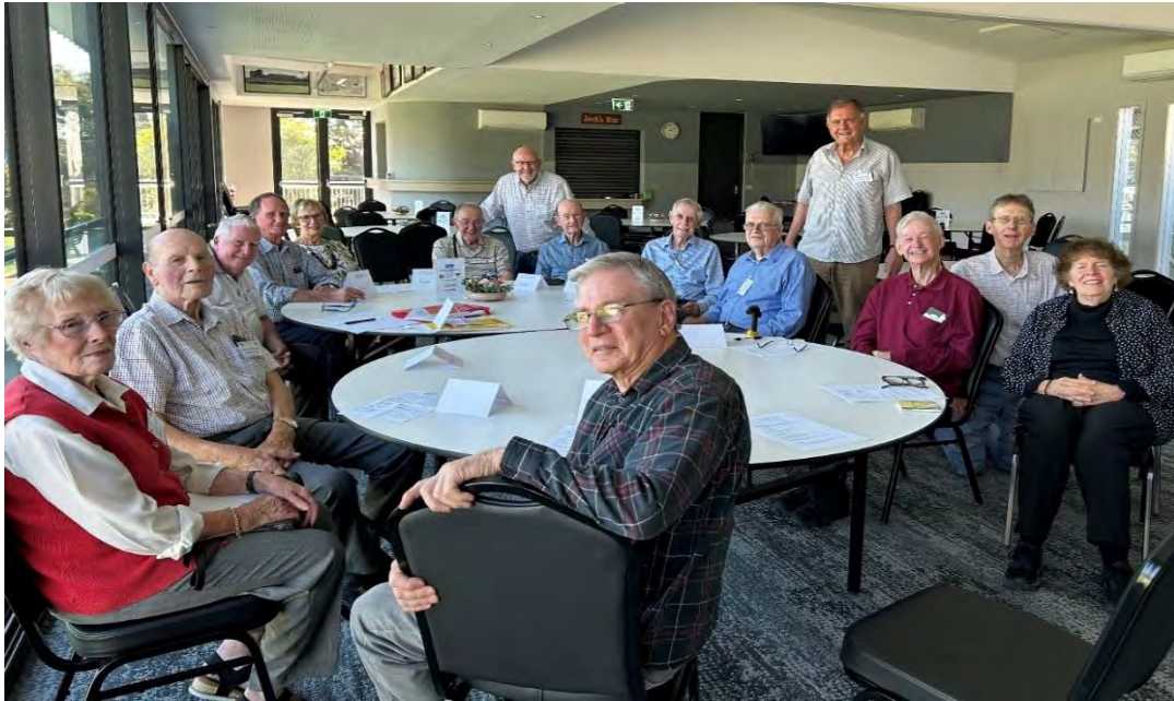
Members attending April discussion Group