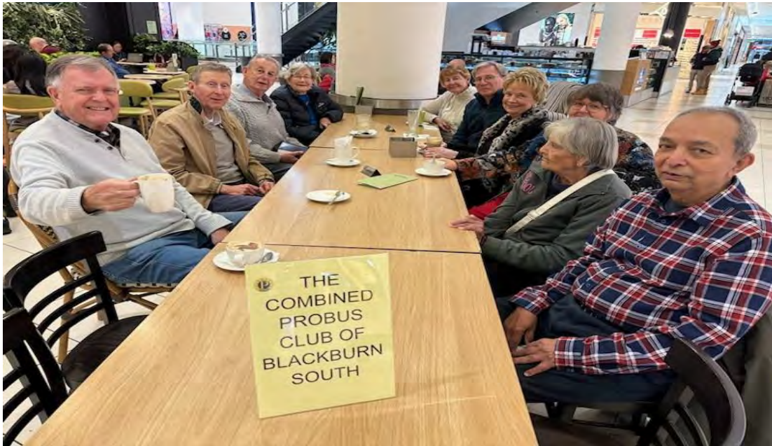
Probus Members enjoying Friday Coffee at Moon & Spoon.