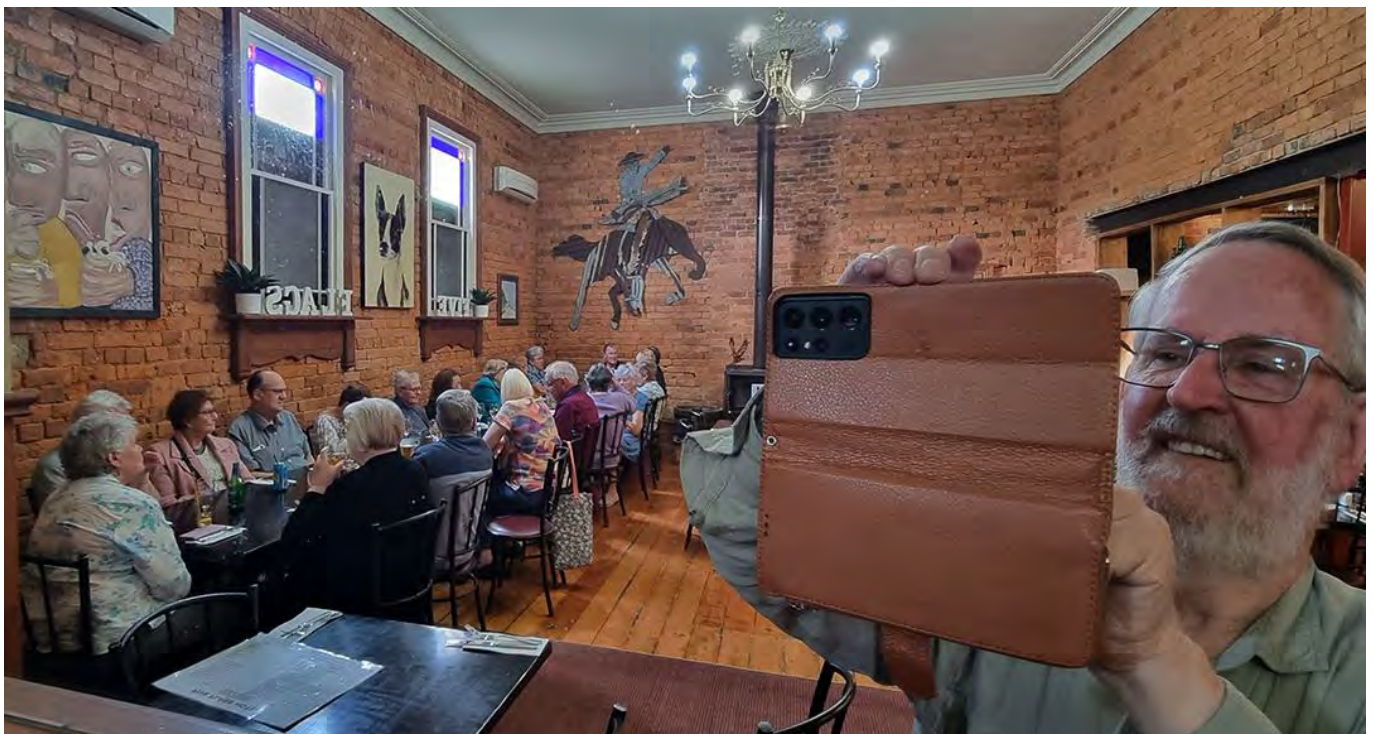
Dinner at The Five Flags Hotel