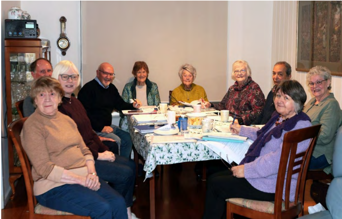
Management Committee Meeting