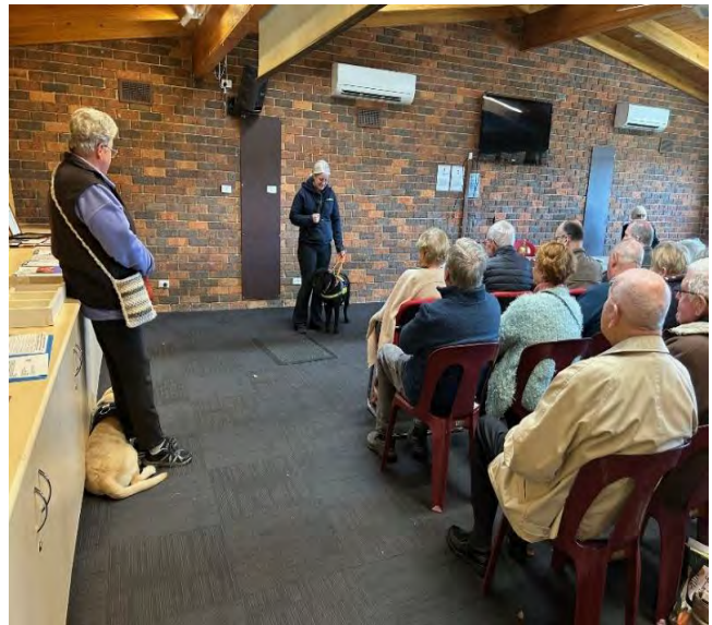
Seeing Eye Dog