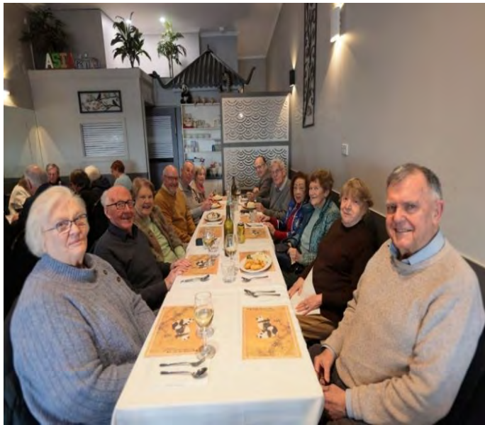
Asian Garden Chinese Restaurant