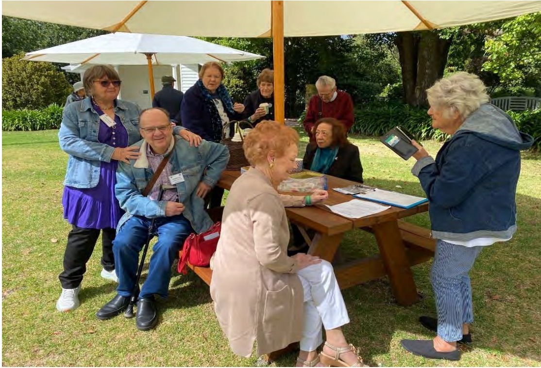
Members enjoying trip to Cruden Farm