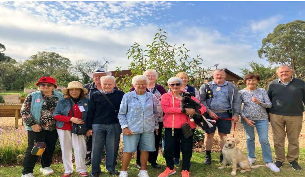
Members at the April Walk to Strathdon House,