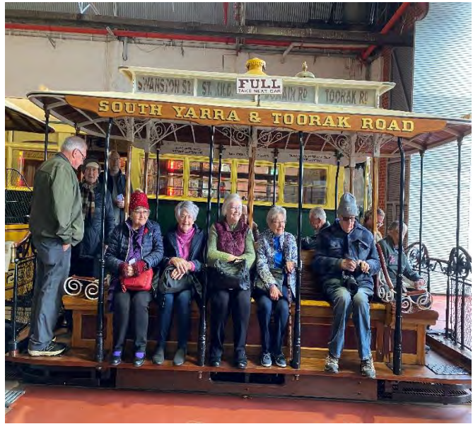
Members at Tram Museum